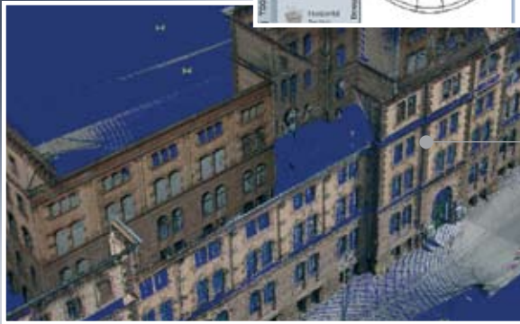
Laser Scanner 3-D Point Cloud