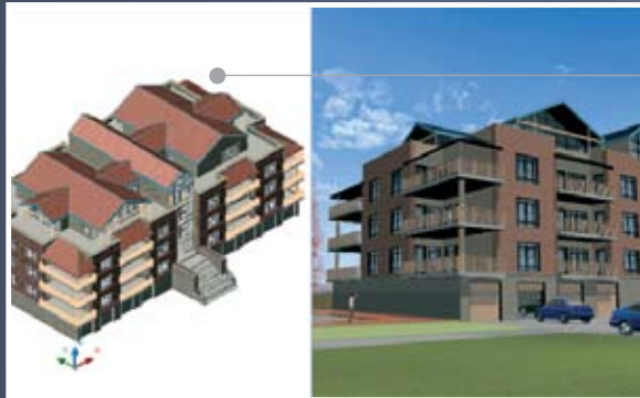
Integrated Rendering to Create Lifelike Design Visualizations